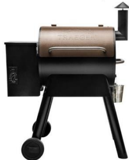
Traeger Pro Series 22 Wood Pellet Grill and Smoker

Tickets: $10 each / 3 for $20 / 15 for $50